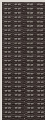
CLOTH DARK GREY AND GREY COMFORT SEATS XC St