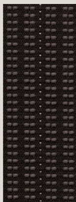
CLOTH BLACK AND GREY COMFORT SEATS DM St