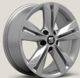
DYNAMIC 48/2 ALLOY WHEELS XC