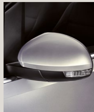
REFLEX SILVER 2