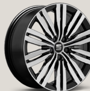
PERFORMANCE ALLOY WHEELS XC