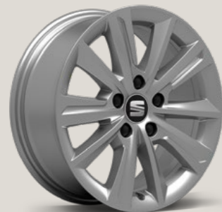
DESIGN 48/1 ALLOY WHEELS St