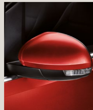
ROMANCE RED 2