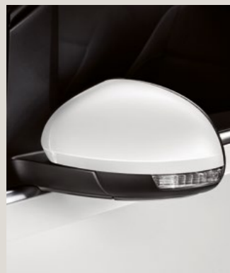
PURE WHITE 1

1 Soft colour. 2 Metallic colour. 3 Exterior mirrors in Atom Grey for FR-Line.