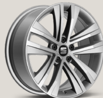
AKIRA ALLOY WHEELS St XC