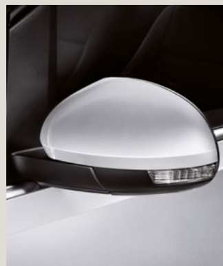
WHITE SILVER 2