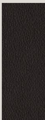
LEATHER BLACK SPORT SEATS JJ + WL1 St XC