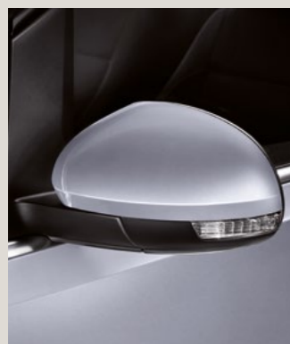
MOONSTONE SILVER 2