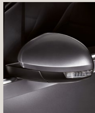
INDIUM GREY 2