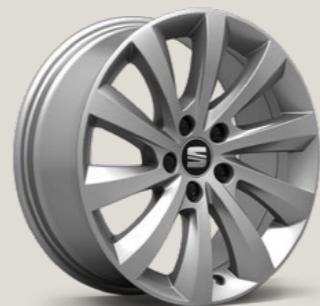
DYNAMIC 48/1 ALLOY WHEELS St