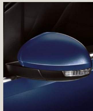
ATLANTIC BLUE 2