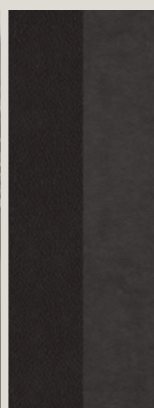
ALCANTARA® BLACK SPORT SEATS JJ + PLT St XC

Style St Xcellence XC FR-Line FR Serial ■ Optional ■