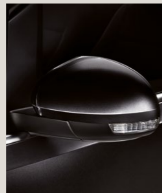
DEEP BLACK 2