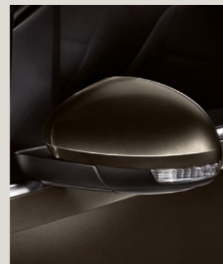
BLACK OAK BROWN 2