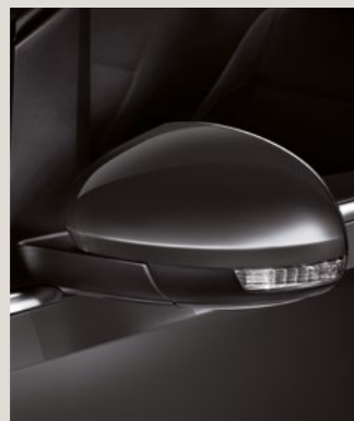
URANO GREY 1