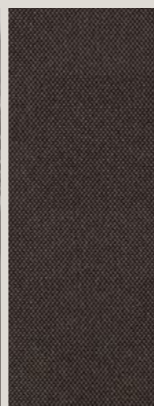
CLOTH GREY MIKELLY EF XC